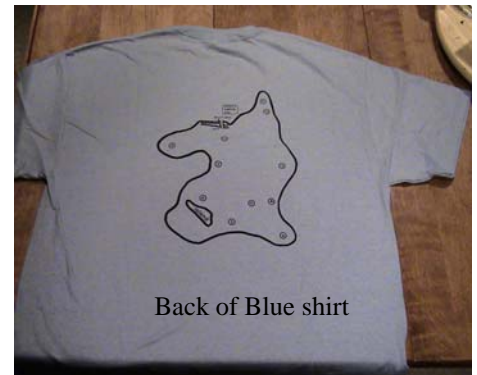
Back of Blue shirt